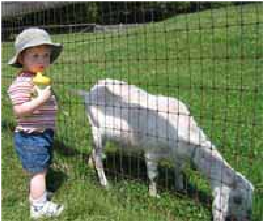
AFC kids enjoyed Drumlin Farm, above, and Chip-In Farm, below. More photos inside.

AFC will provide free pizza for members, families, friends and anyone else interested in exploring what the organization has to offer. This is also a good opportunity to renew memberships – all memberships renew in September for $20 a year. RSVP with number