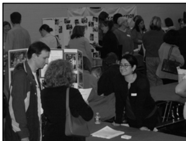
Hundreds of attendees packed Stratton at the 2007 open house.

Mark your calendars for AFC's seventh annual open house night on Thursday, October 2, 2008. This special event allows parents and caregivers the opportunity to meet with representatives of the preschool and daycare facilities to learn more. Bring the kids and your questions and join us in October!